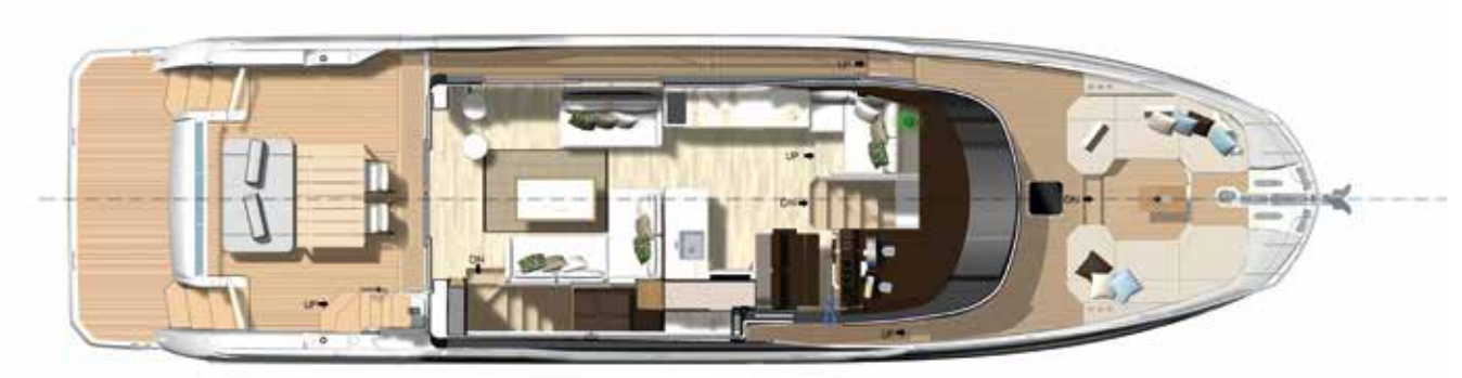
Main deck - Exterior dining version