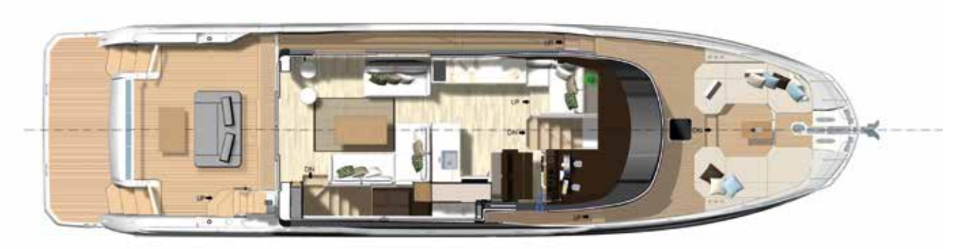
Main deck - Interior dining version