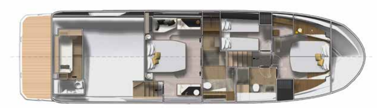
Lower deck - 3 Stateroom 2 Bathroom