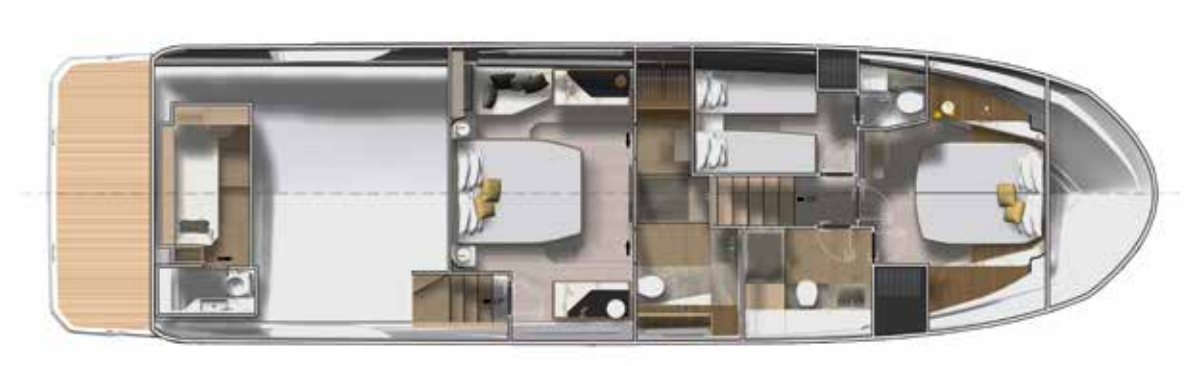
Lower deck - 3 Stateroom 3 Bathroom