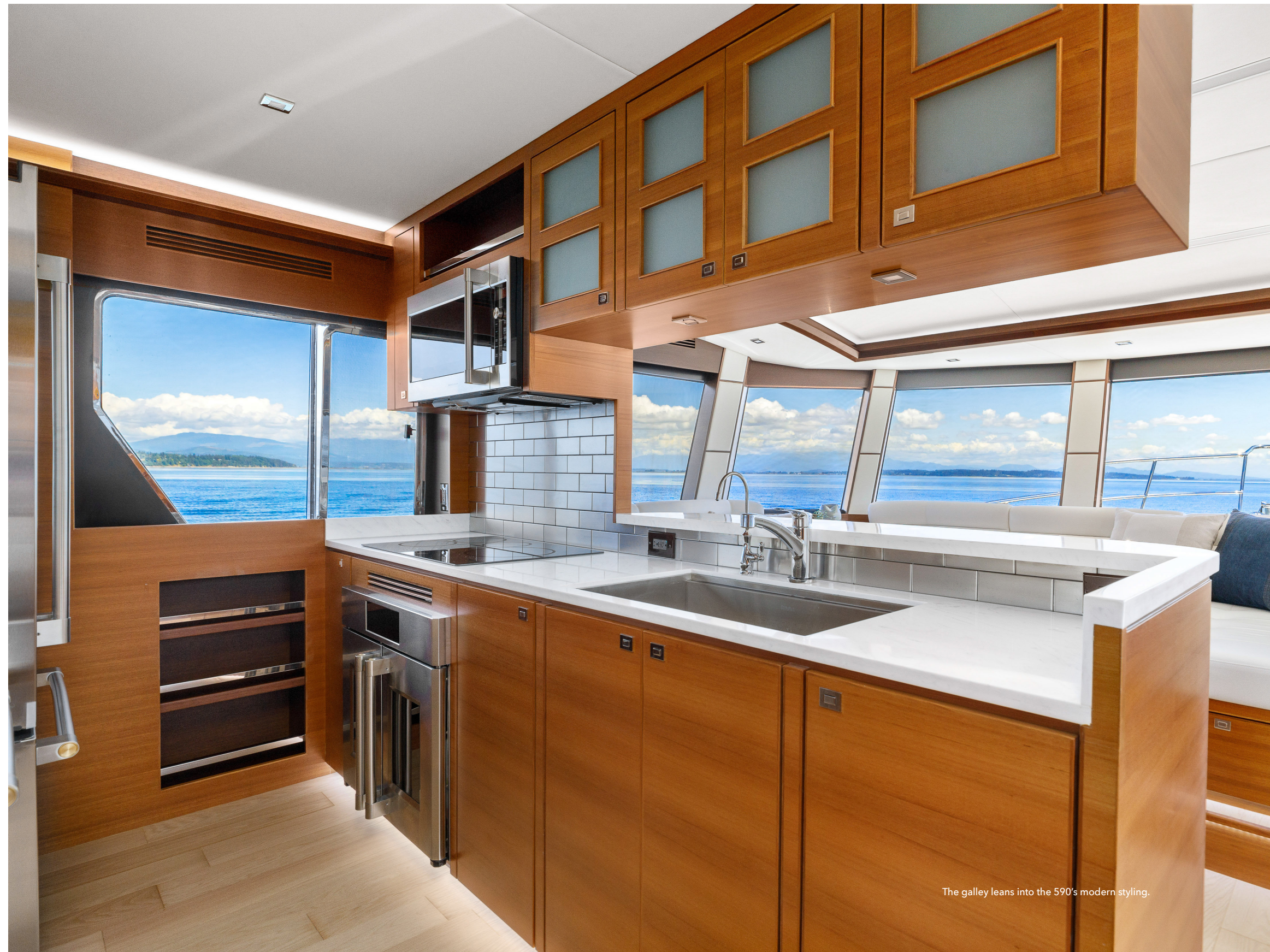
The galley leans into the 590's modern styling.