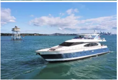
The next level in yachting style and comfort from a well known and reputable Italian brand The Azimut 85 offers next-level yachting luxury with ample living space in 4 staterooms with ensuites, comfortable saloon, elegant dining room, separate galley, and well-appointed pilothouse.